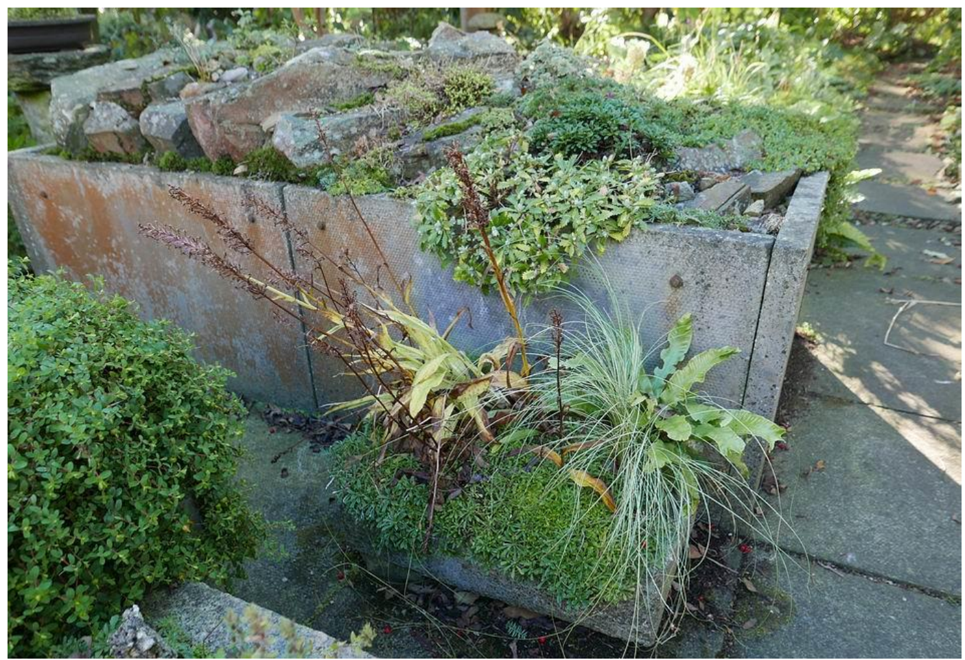
Trough with naturalistic planting most of which has seeded there without my intervention including the orchids, the grass and the fern.