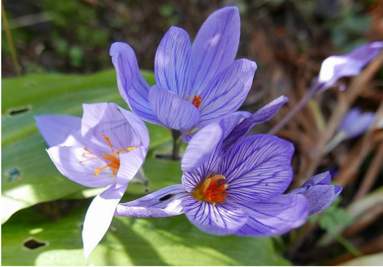
One pale and two dark flowers of Crocus speciosus.