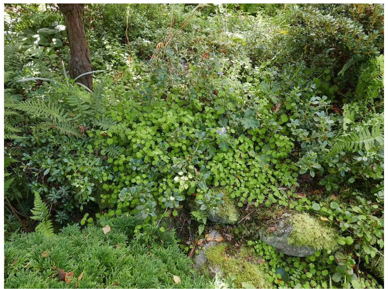
Fuchsia procumbens has found a habitat where it can survive and grow in the raised wall where it can retreat underground for the winter to a relatively dry condition among the rocks.