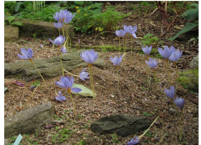
Sand bed 2016

I think that gardening is about understanding and manipulating habitats and to that end I created this sand bed (left) some years ago. It was planted up with some small crocus corms plus seed and after a few years it was well populated by Crocus as you can see below.