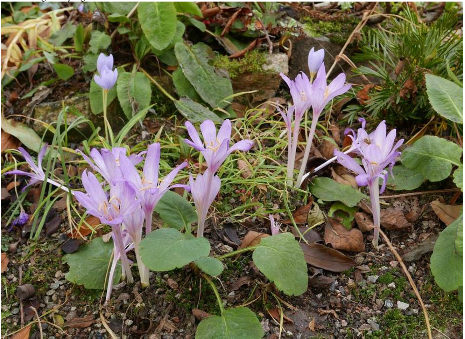
A group of Colchicum x agrippinum that was spilt from a congested clump last year with a few bulbs being planted back here and the others spread around the garden.

being split while elsewhere in the garden similarly aged plantings of Colchicum autumnale and Colchicum agrippinum have been divided several times. Whatever these are I will continue to enjoy their flowers that come as most foliage is dying back.