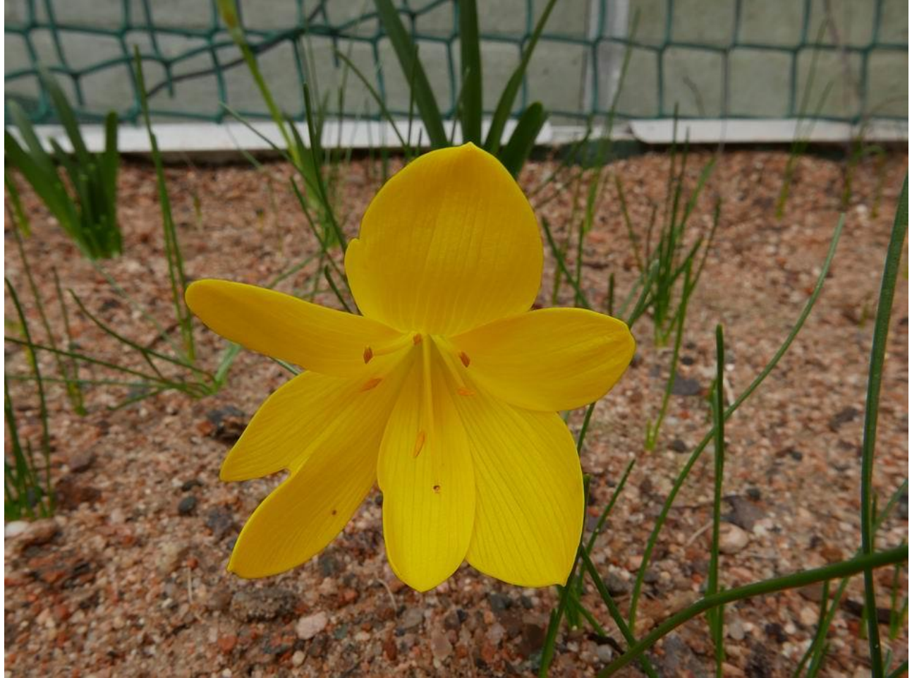
I have struggled to get Sternbergia lutea to flower in consecutive years and while it is early days I am encouraged that this is one of a handful that flowered in the sand bed last year and they are all flowering again this year. The feeding and watering regime are much the same as I used when they were in pots so I suspect that they are enjoying the extra freedom that their roots have to explore.

A lonely Sternbergia sicula flowers in one of the new sand beds I converted this year in the bulb houses. One of the greatest lessons we can learn about gardening is to be patient and enjoy the process as a new bed or planting grows naturally from small plants of seeds and not to go for the instant effect by cramming it full of mature plants. I also want our garden to have plants of all ages from seedlings up to mature specimens just as I would see in nature so I am happy to wait as the seed and small bulbs in these beds grow each year.