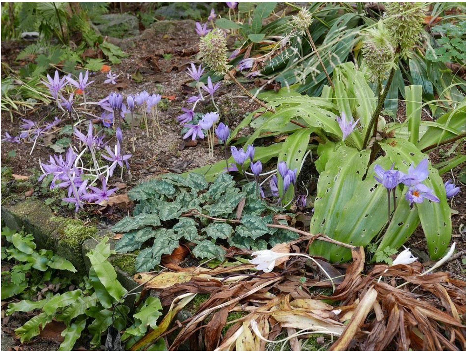
New Colchicum and Crocus flowers alongside the decaying and chewed leaves bearing all the scars of the season make this unmistakably an autumn scene. The remains of the leaves will be left to decay and return to the soil or be lifted and placed on the compost heap to be recycled and returned to the ground later.