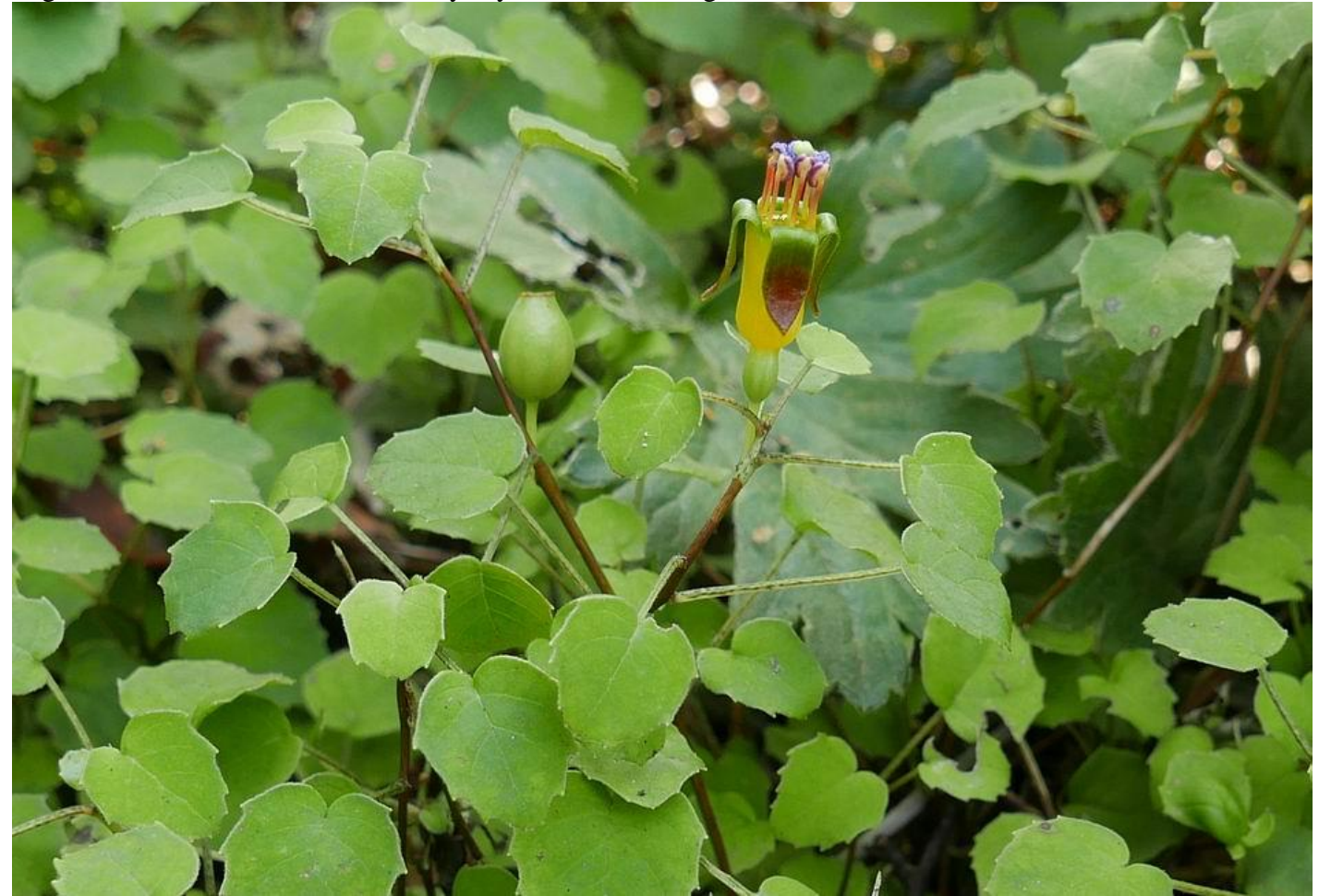
Fuschia procumbens flower and seed pod forming – which will turn bright tomato red if it gets a chance to ripen before the weather turns too cold and dark.