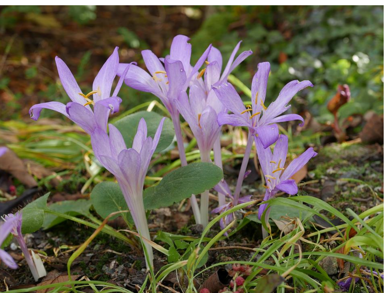
Colchicum x agrippinum