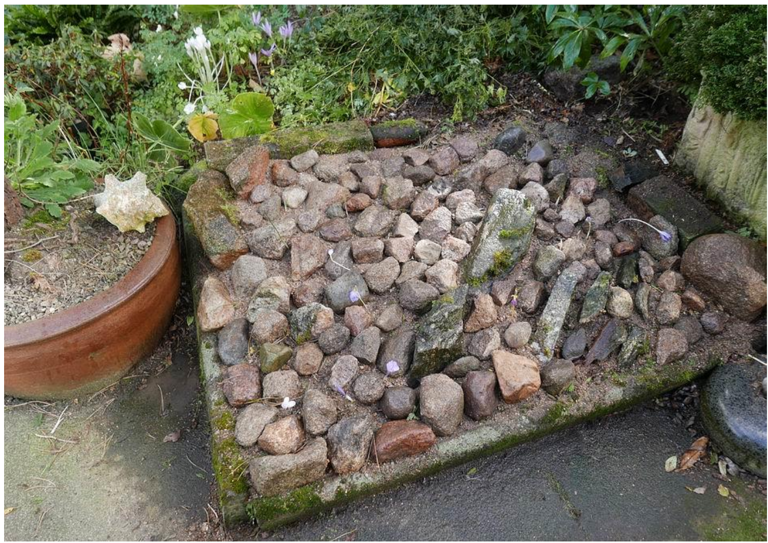
I now plan to re-populate this bed with Crocus by corms and seed in the hope that this bit of habitat manipulation will reduce the predation by mice to an acceptable level. I also think it looks better and might become a habitat to other some non-bulbous plants.

garden and had dug up a heap of stones - these were just what I want so I spoke with the owner who was only too pleased for me to have the stones.